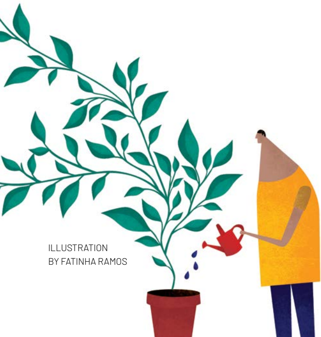
ILLUSTRATION BY FATINHA RAMOS