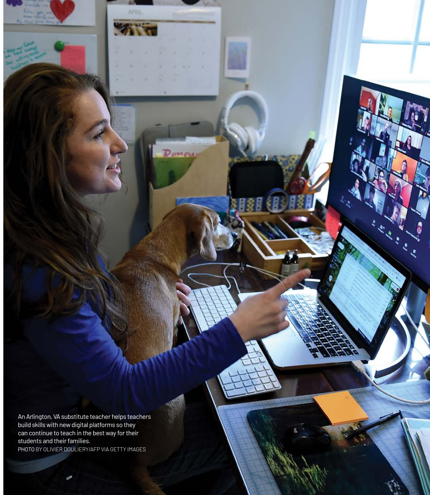
An Arlington, VA substitute teacher helps teachers build skills with new digital platforms so they can continue to teach in the best way for their students and their families.