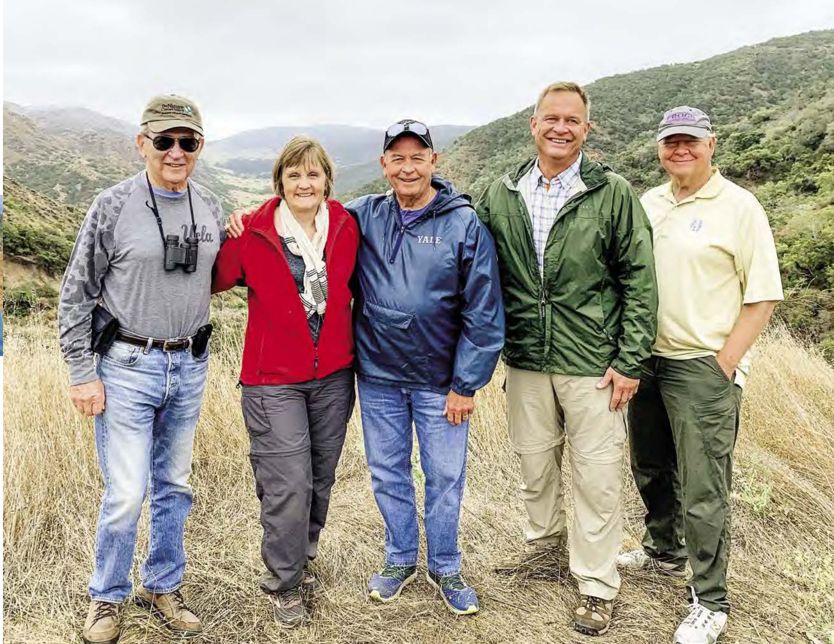
MACP's joint board on a Southern California site visit to observe the results of biodiversity preservation work. Pictured from left: