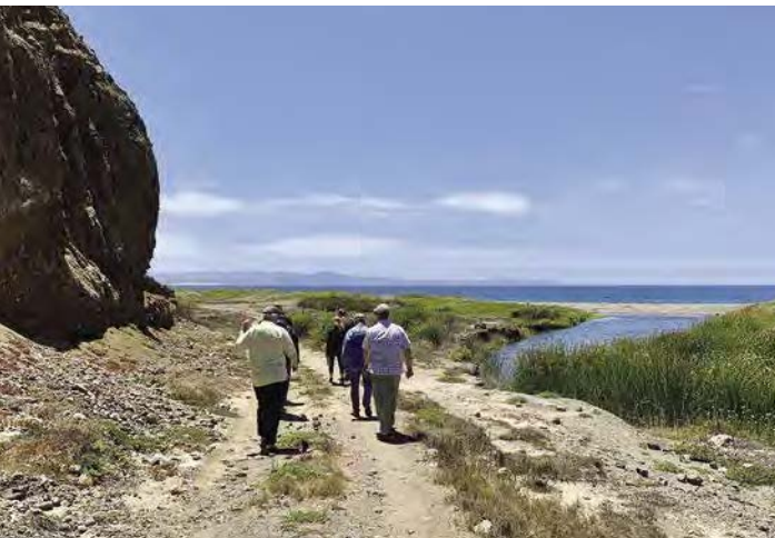
Above: MACP board members visit Santa Cruz Island in California, where funding for The Nature Conservancy's science and planning work have contributed to preservation of biodiversity.