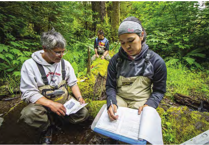
Above: Members of the Hydaburg Stream Team assess the conditions of salmon-bearing streams on Prince of Wales Island.

MACP works globally and domestically to support the conservation of natural resources and protection of natural habitats, including tropical rainforests, coastal ecosystems, freshwater ecosystems, and grasslands. To accomplish our goals, we work with grantee partners on community-based conservation.